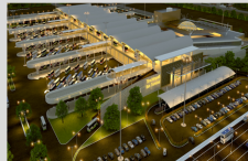
PANJAPUR INTEGRATED BUS TERMINAL